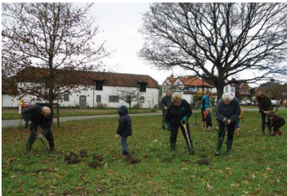
Villagers planting bulbs by the A4.

Community affects us all and makes the village a better place to live. We know that there are already plenty of people who check on their neighbours and help them when they need things like a lift to the doctor's surgery or help with filling in a form or even just a chat